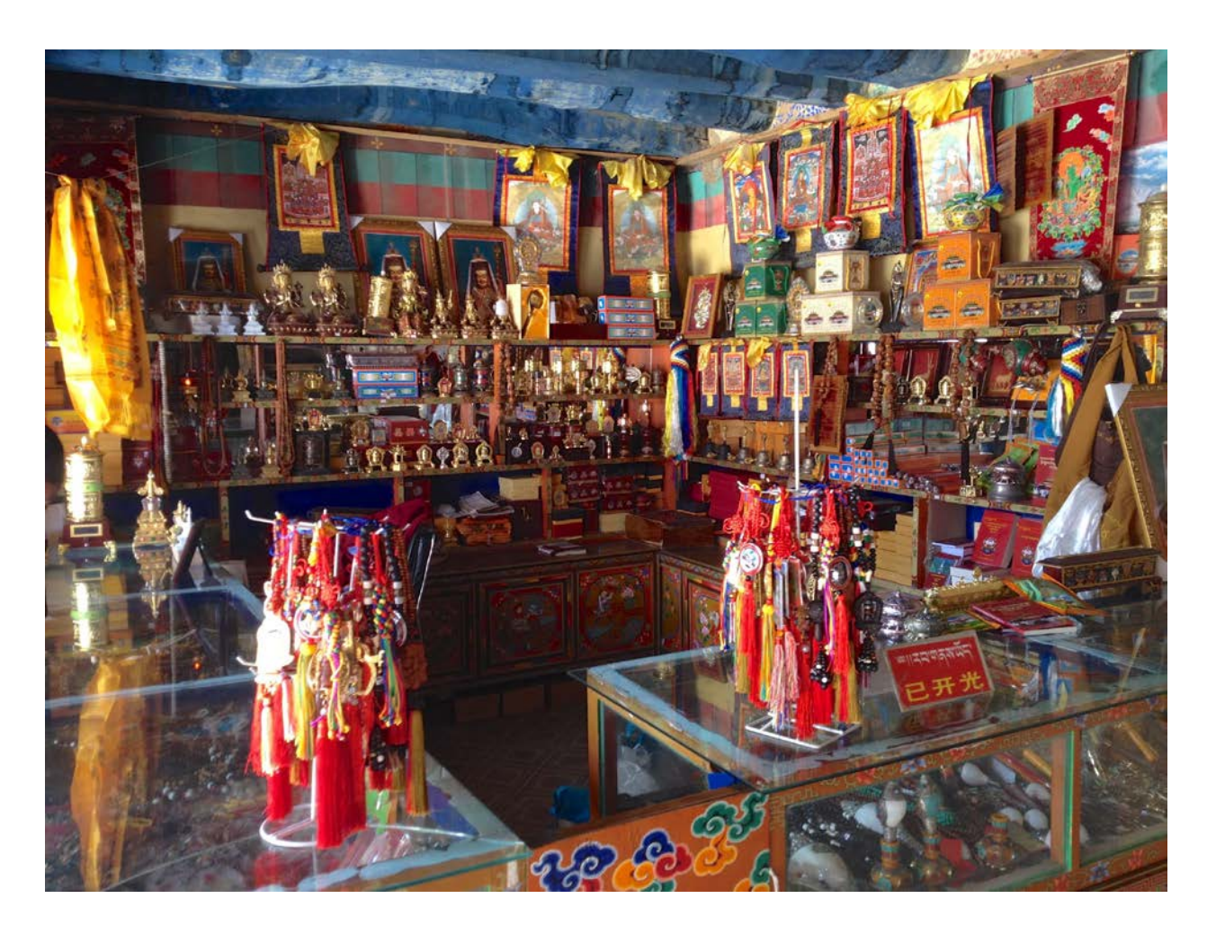
Figure 3. Shows a typical souvenir shop in Tibet with various consumables related to Tibetan Buddhism.